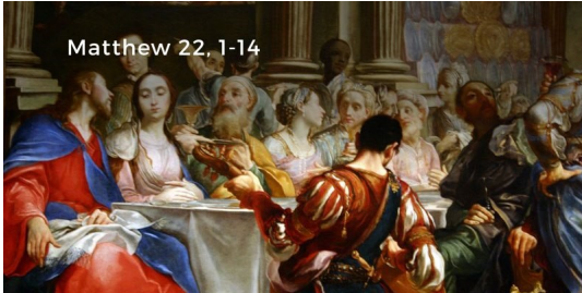
Matthew 22, 1-14

May the Father of our Lord Jesus Christ enlighten the eyes of our heart, that we might see how great is the hope to which we are called. Alleluia!